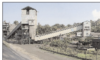
Integrated Mineral Beneficiation Plant Dongri Buzurg Mine