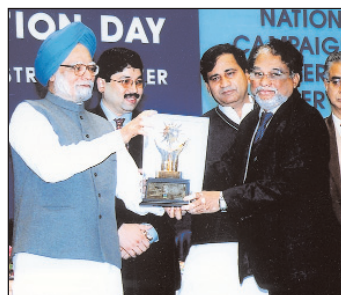
Special prize for getting first prize for three consecutive years 2003, 2003 & 2004

During the year 2003, a team from Bhilai Steel Plant consisting of five employees bagged the prestigious Prime Minister's Shram Ratna Award - the highest award in this category. In addition to this, another team from Bhilai and one employee from Bokaro Steel Plant have bagged the Shram Vir award for the year 2003.