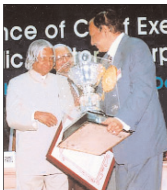
SCOPE Award for turnaround