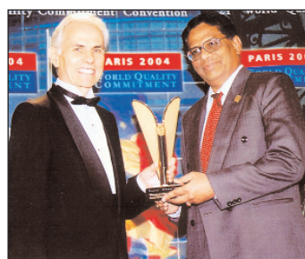
World Quality Commitment Award