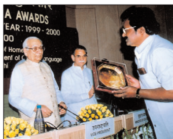
Indira Gandhi Rajbhasha Award

The Company also recognizes the talents within the Company and encourages its employees to actively participate and give suggestions for improvement in the performance of the Company.